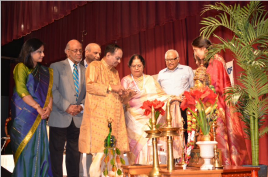
With Dr. M. Balamuralikrishna at a SAPNA Event in Chicago