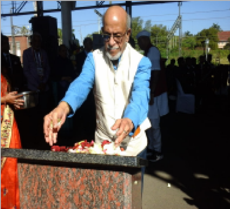
Offering Floral Tribute at the Gandhi Plaque of Satyagraha Pietermaritzburg South Africa